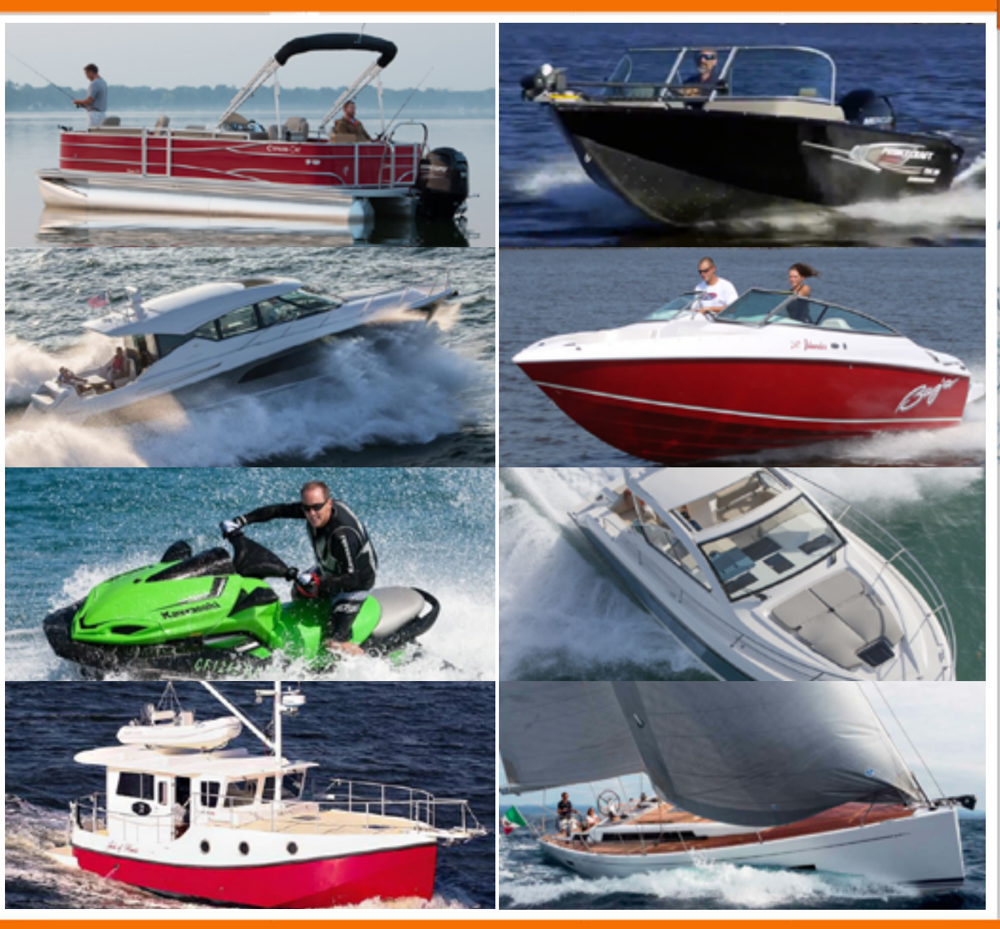
Plus 45 "First Look" Videos